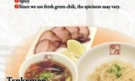
Tsukemen (Dipping Ramen) - Cold Noodle - $11.00 つけ麺 Pork Broth Dashi Shoyu Base, Radish Shoot, Spinach, Bean Sprouts, Carrots, Green Onion, Toro Chashu(5), Lime, Grated Radish, Ginger, Grated Sesame Seeds