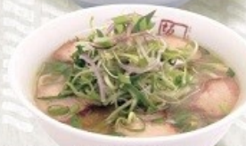
Green Chili Shio Ramen $10.50 青唐うま塩ラーメン Pork Broth, Shio Base, Shoyu Base, Toro Chashu(5), Green Chili, Nappa, Asian Chives, Red Onion, Green Onion, Sesame Oil