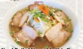
Mixed Boiled Vegetable Shio Ramen $10.50 茹で野菜たっぷり塩ラーメン Pork Broth, Shio Base, Shoyu Base, Toro Chashu(5), Mixed Boiled Vegetables(Cabbage, Bean Sprouts, Carrots, Spinach, Green Onion), Asian Chives