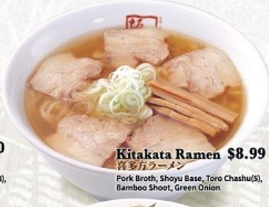
Kitakata Ramen $8.99 喜多方ラーメン Pork Broth, Shoyu Base, Toro Chashu(5), Bamboo Shoot, Green Onion