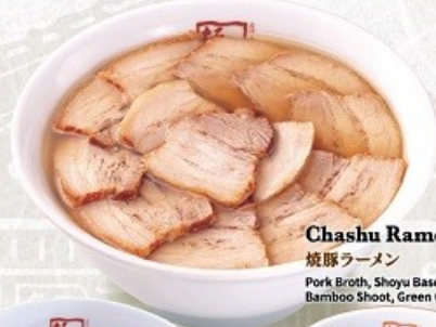
Chashu Ramen $13.50 焼豚ラーメン Pork Broth, Shoyu Base, Toro Chashu(13), Bamboo Shoot, Green Onion