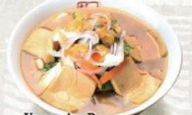
Vegetarian Ramen $11.99 ベジタリアンラーメン Vegetarian Broth, Miso Base, Seasoned Tofu(5), Cabbage, Nappa, Carrots, Spinach, Green Onion, Red Onion, Garlic, Sesame Oil