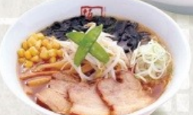
Aburi Miso Ramen $10.50 炙りみそラーメン Pork Broth, Miso Base, Toro Chashu(5), Bean Sprouts, Seaweed, Corn, Snow Peas, Bamboo Shoot, Green Onion, Chili Oil