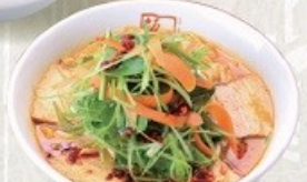
Spicy Miso Ramen $10.50 スパイシーみそラーメン Pork Broth, Spicy Miso Base, Toro Chashu(5), Green Onion, Carrots, Spinach, Bean Sprouts, Cabbage, Spicy Carrot Oil